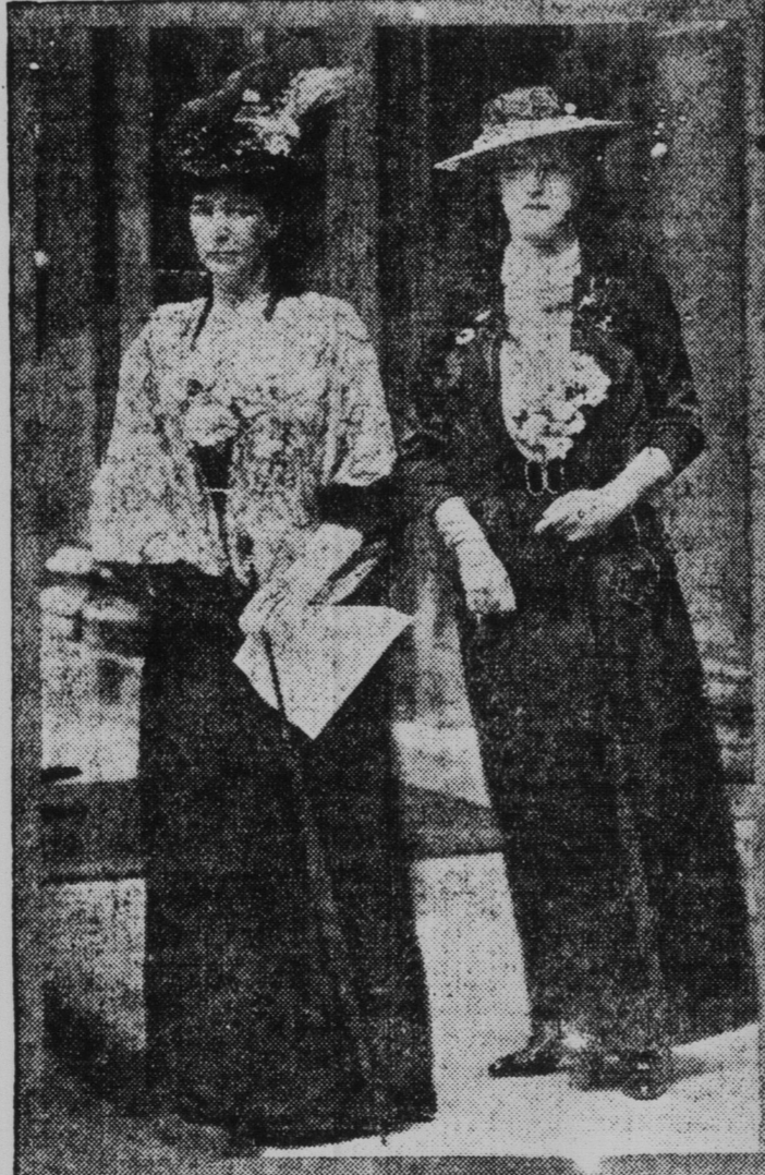
H. M. Queen Alexandra and Princess Victoria leaving Marlborough House on their tour of the metropolis.

Stores Open till 10 Every Friday Evening. Close Saturday 1 p.m. This is for June, July, and August.