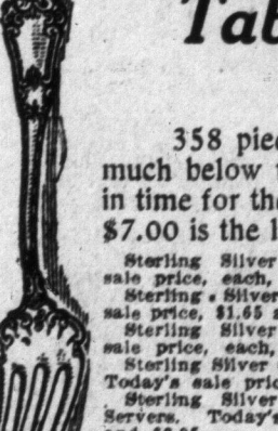
Table Pieces Away Less Than Half Price!

Choose from shirts and drawers in natural shade. Sizes 34 to 44. Today, 59c garments for 42c.