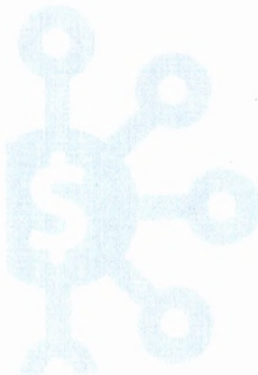
FDI-GDP Ratio 2012-2016