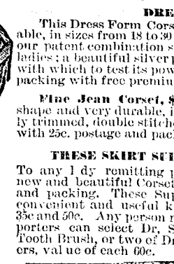
W. GODBEE BROWN & CO.