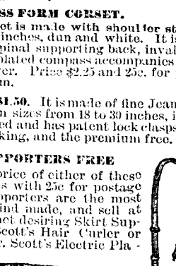
W. GODBEE BROWN & CO.