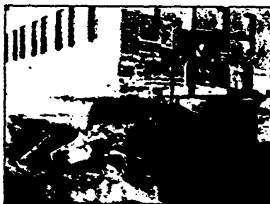
55-INCH CROCKER TURBINE FOR BOSTON RUBBER CO., ST. JEROME, QUE.

Where the water supply is variable, and at times inadequate, the high efficiency of this wheel is a valuable feature. If your present equipment is not giving you the power you need, consult us.