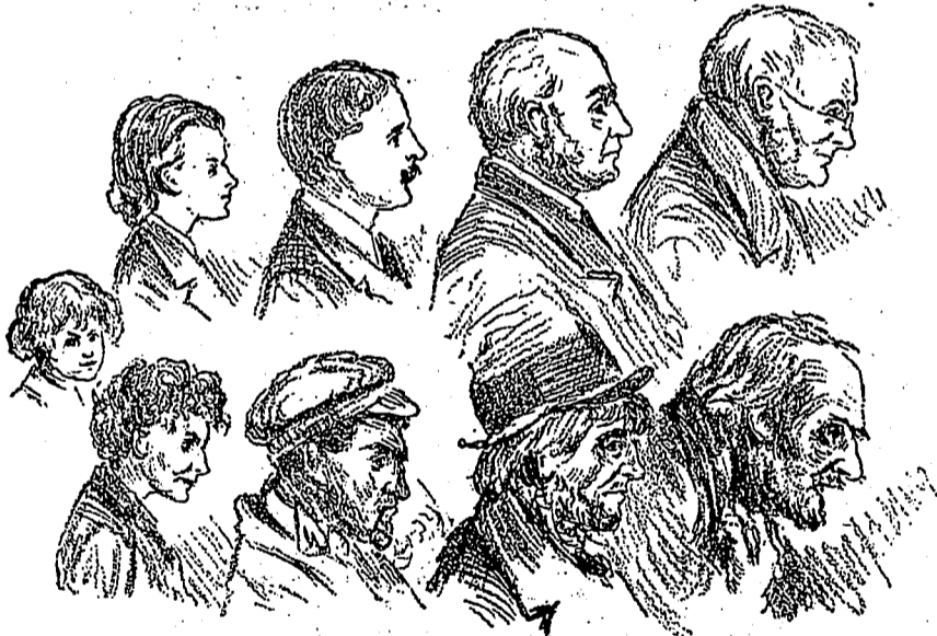
WHICH WILL YOU BE?

I HEREBY CERTIFY that..... 189..... having taken the above PLEDGE, is a Member of..... Band of Hope..... President..... Vice-President..... Countersigned by..... Sec.-Treas.