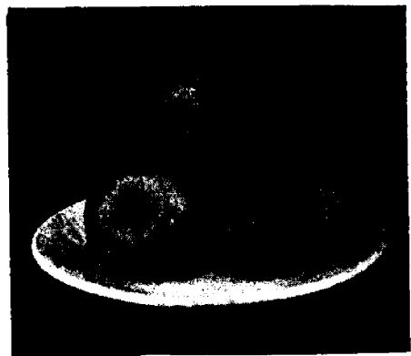
FIG. 1205. --YELLOW TRANSPARENT.

This variety has been fully described in the last report of the Ontario Fruit Experiment Stations, which is sent free to the members of our Association.