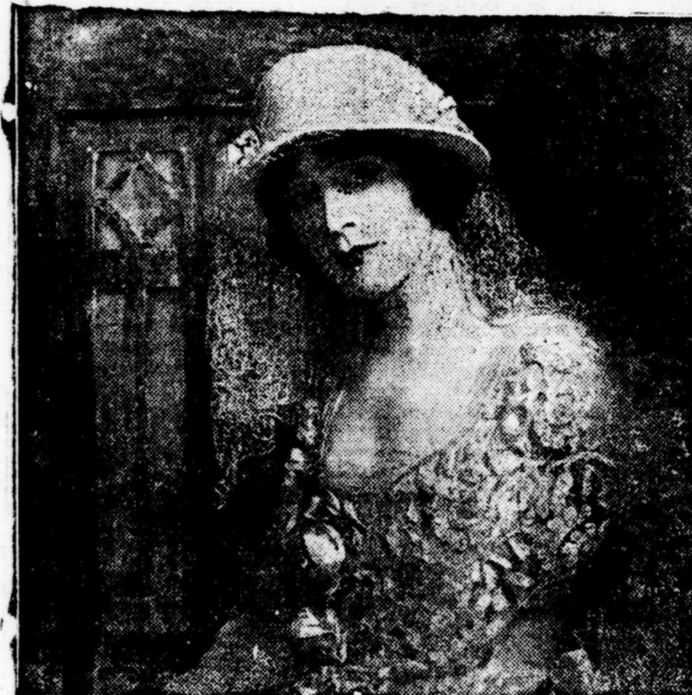
Miss Jane Cowl, Mistress of the American Stage, who will be seen in her supreme production, "Smilin' Through," at the Grand Theatre, Monday and Tuesday night.