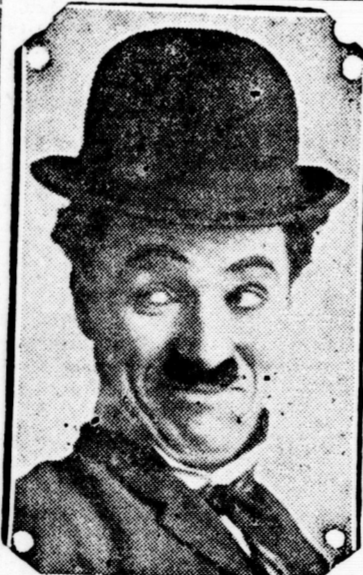
Charlie Chaplin, who stars in "Shanghai," at the Grand Theatre, the last half of next week.

brand of merriment are so obvious as to require no comment.