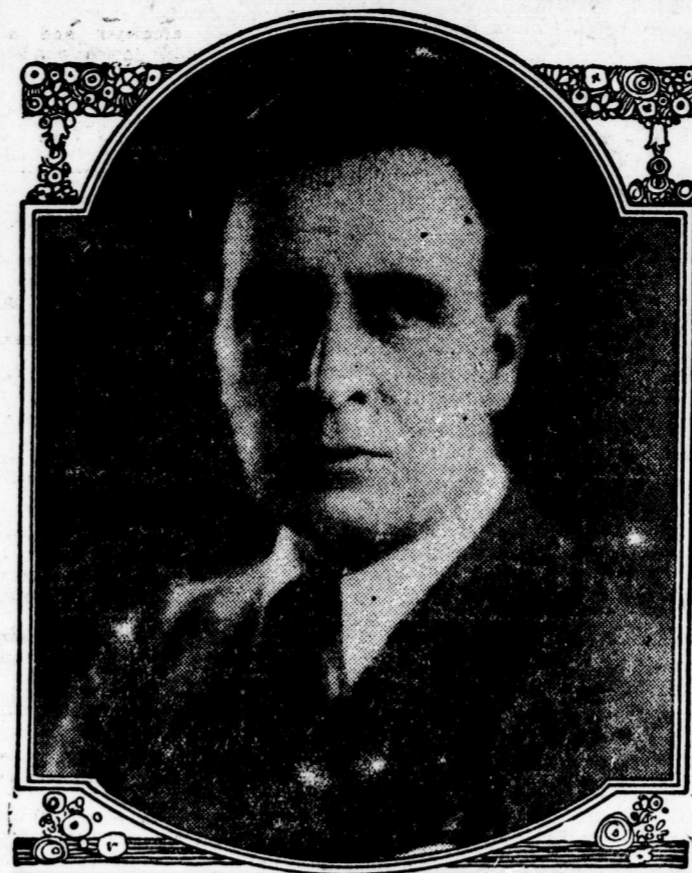
Conway Tearle, who comes to the Grand Theatre, Wednesday, Thursday, Friday and Saturday, of next week, in his best picture, "A Wide Open Town."