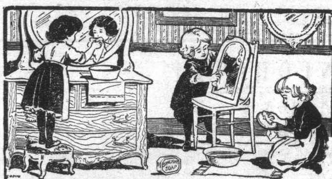
Sunlight Soap makes homes bright.