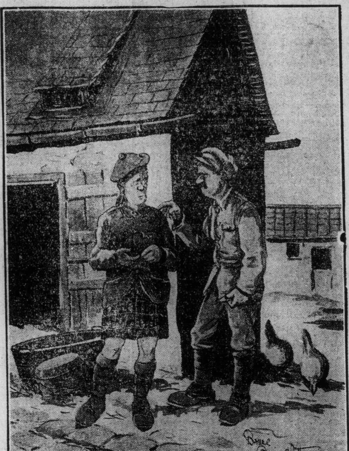
THE MYSTERIES OF FRENCH MONKY. "You owe me two francs and I owe you one that's got in the lining of me coat; that makes it right don't it?"—London Bystander.

flag, and one desire, one King and one Empire." Assembled on Parade Ground. On Saturday, July 8th, 1916, when night had fallen, a huge camp fire was kindled on the parade grounds; a shrill whistle sounded and the Indian braves in khaki formed two straight lines. A hush of expectancy fell on the crowd as it waited for the appearance of the captain in war paint and feathers. Romantic Surroundings. The wind, whistling mournfully through the tree tops, the cloudy sky and full moon, the flickering of uncertain shadows and the glow of the fire as it played on the dark stolid faces of the Indians all added a dash of romance and enchantment to the scene and made a perfect setting for the ancient ceremony. A thrill of excitement passed through the waiting people as Capt. MacDonald emerged from the barracks clad in fringed shirt, beaded belt and a black wig with the scalping lock and the three symbolical eagle feathers of the Mohawk tribe. A Weird War Chant. Hand in hand with Chief Jo Henry he paced solemnly up and down the path. Suddenly the old chief burst into a weird war chant and the natives commenced a deep rhythmic luh! huh! huh! As it grew in vol-