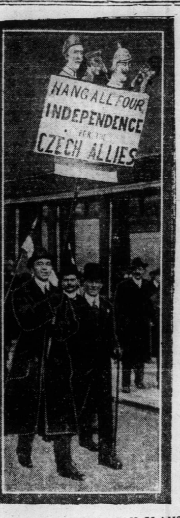
"HANG ALL FOUR," SAY SLAVS A great procession of Russians and other brands of Slavs marched through London to the hotel where the Crown Prince of Serbia is stay- ing, recently, carrying in effigy the figures of the Austrian Emperor Franz Josef, the German Kaiser, King Ferdinand of Bulgaria and the Sultan of Turkey.

expression of the Russian Govern- ment's gratitude for the transfer of the vessels it was emphasized that they have paid for their value many times over in the facilities they have afforded for the landing of cargoes of munitions at the White Sea Port. The Latest Word.