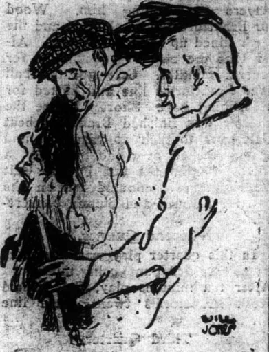
"WAS!" ASHURN SHRIEKED PELLMAN.