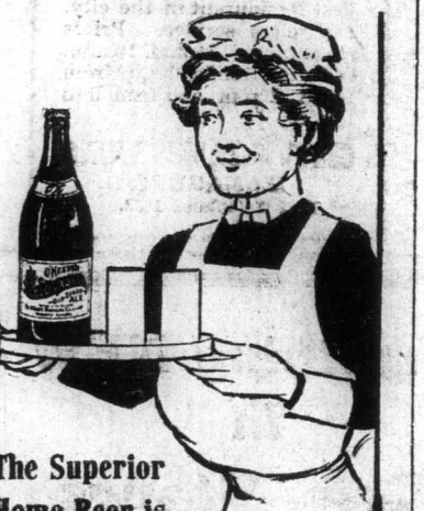
The Superior Home Beer is