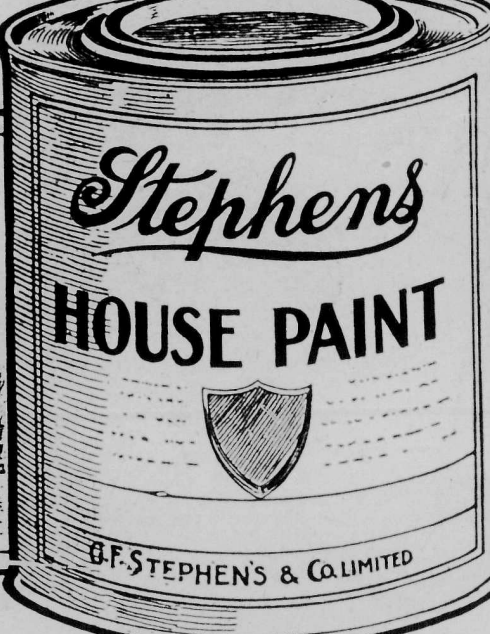
G. F. STEPHENS & CO., LIMITED, int and Varnish Makers,

Write us for Free Booklet No. 11 and learn more about this essentially Western Paint.