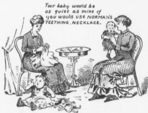
Norman's Teething Necklace will keep your child quiet when nothing else will.