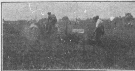
A Three-Wheel Tractor in Operation at the Demonstration.