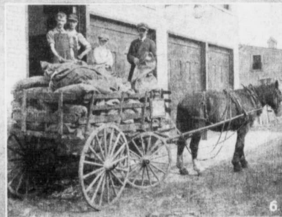
1.—View of the Main Office. 2.—A few of the big Presses. 3.—Compositors and Proof-readers. Note The Guide pages standing in type on the "Stone." 4.—Type-setting Machines. 5.—Girls assembling the "Forms" of The Guide, Folding Machines in the background. 6.—Dray-load of Mail Bags ready for Posting.