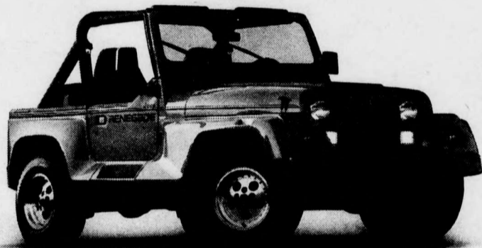
Jeep YJ The fun-to-drive convertible From $12,165**