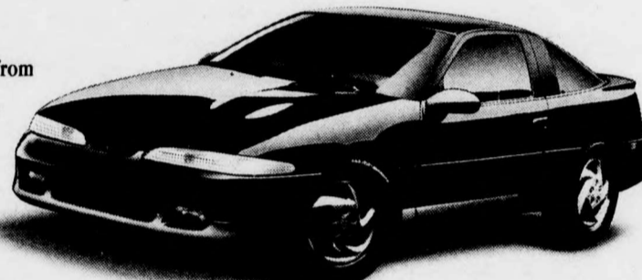
Eagle Talon Driving excitement from an award-winner From $16,205**