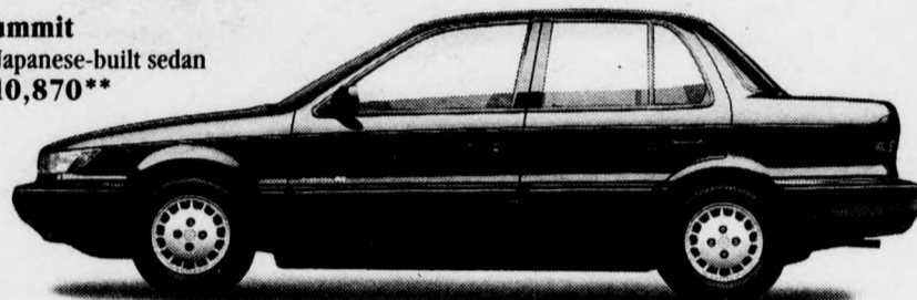
Eagle Summit A sporty Japanese-built sedan From $10,870**