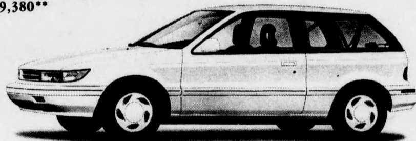
Plymouth Colt 200 A high-spirited car with style From $9,380**

You've worked hard for your education. And now Chrysler wants to start you on your way with incredible savings on your first new car or truck.