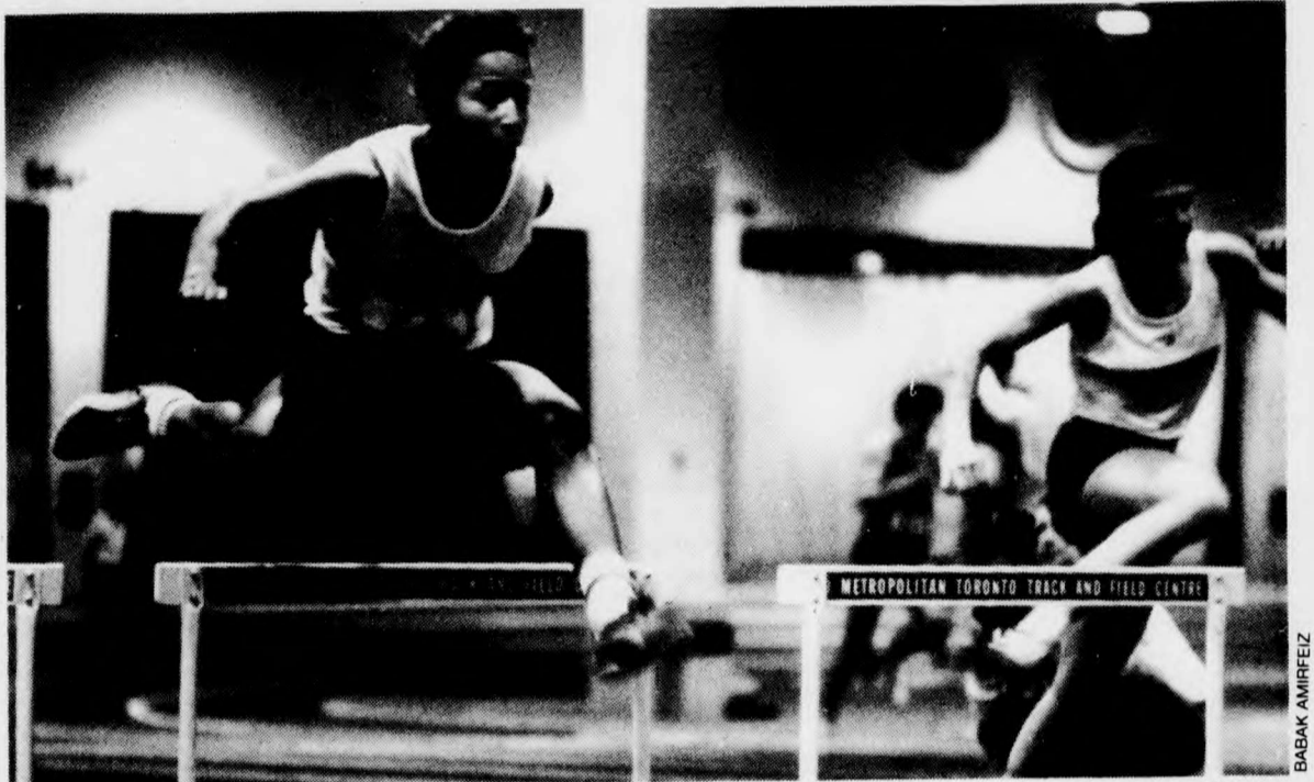
FLY LIKE AN EAGLE: The York Track and Field Invitational boasts fine performances by Canadian athletes while York's talent shone through in the 60-metre hurdles and the long jump.