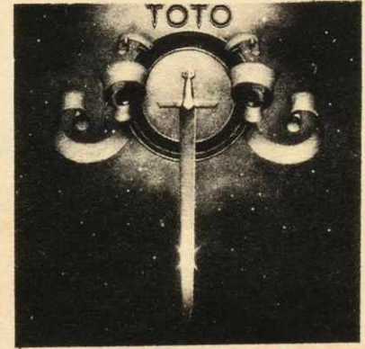
Toto on Columbia