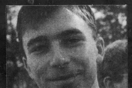
CAAK-2nd yr. COMPUTER SCIENCE