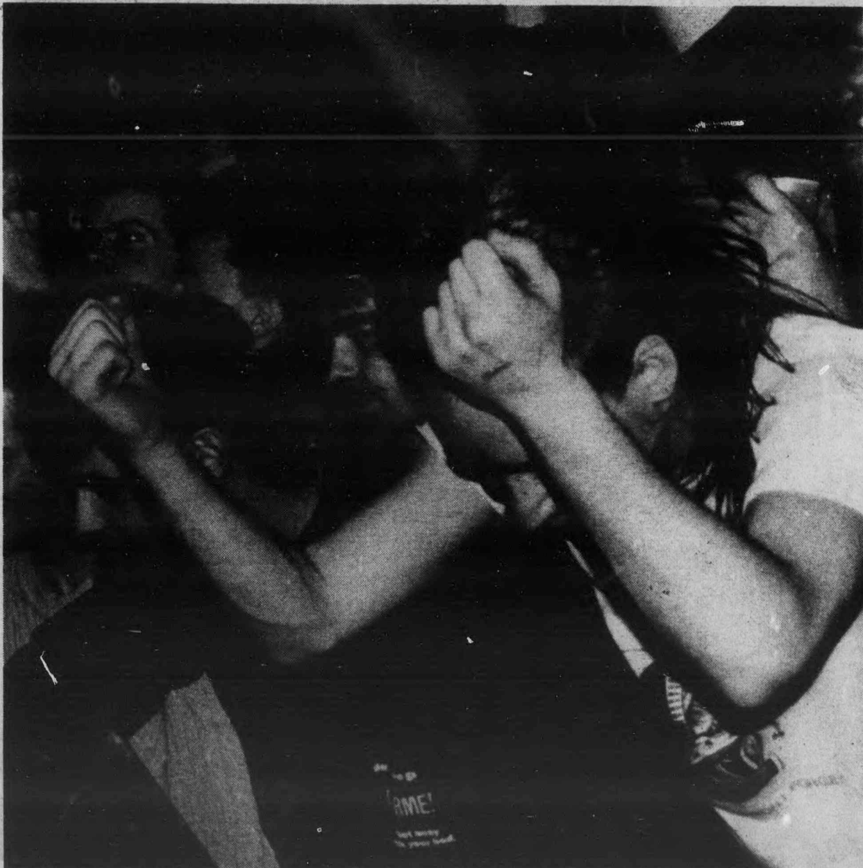
Concert: Students appeared to have enjoyed the Tragically Hip concert last Friday night. However, the Student Union and Campus Security have a few worries about some of the things that went on during the concert. See story page three