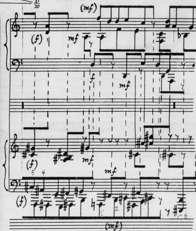
Excerpt from score to Bridge, for 2 pianos, 8 hands.