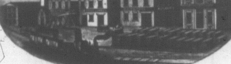
"Cabnet Trim Finish" for Dressings, Drug Stores, Offices, etc. School, Office, Church & House Furnitures. Bricks, Limes, Cement, Portland Cement, etc. Also, all kinds of Builders' Materials. SEND FOR ESTIMATES.

1,000,000 FEET LUMBER KEPT IN STOCK. PLANING MILL, SAW MILL, SHINGLE MILL, LATH MILL.