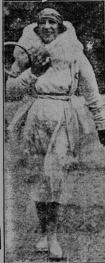
Mlle. Lenglen, French tennis champion, photographed on her way to the tennis court at Beaulieu.