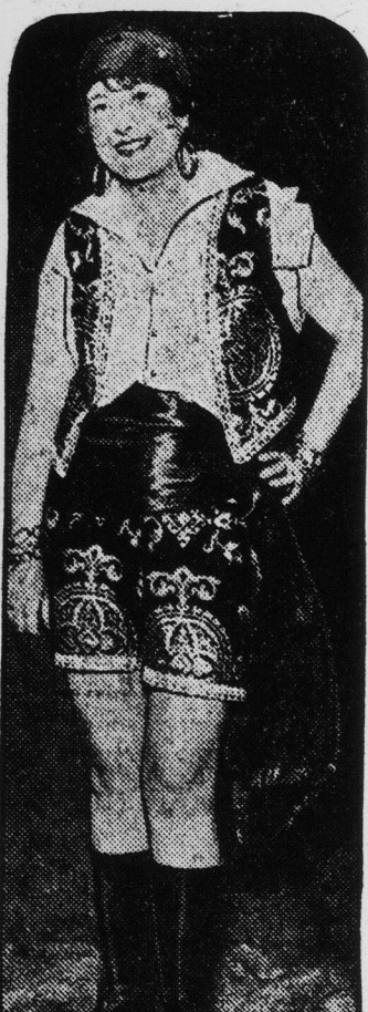
Yo-ho-ho, and a cup of tea! When New York society goes a-pirating, it does it in clothes like these. Stunning effects in ruffs of colors can be secured when one wants to attend a costume ball as Captain or Mrs. Kidd. The outfit shown is one seen at the Pirate Ball at the Westchester, Baltimore Country Club at Rye, N. Y.