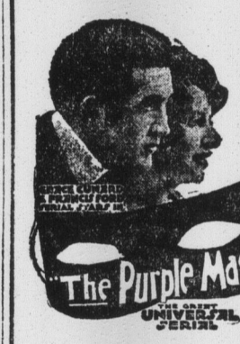
The Purple Mask

Does Detective Kelly Use the Handcuffs? Does He Capture the Jewel Thief?