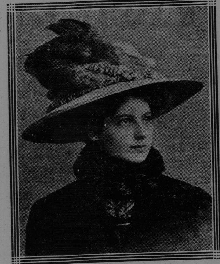
FROM PARIS COMES THE PIERROT RUFF.

Scarcely any face that these gay little neck ruffs do not make more piquant and alluring than the pretty affairs are so easy to fashion that many women have a Pierrot ruff to complete every frock.