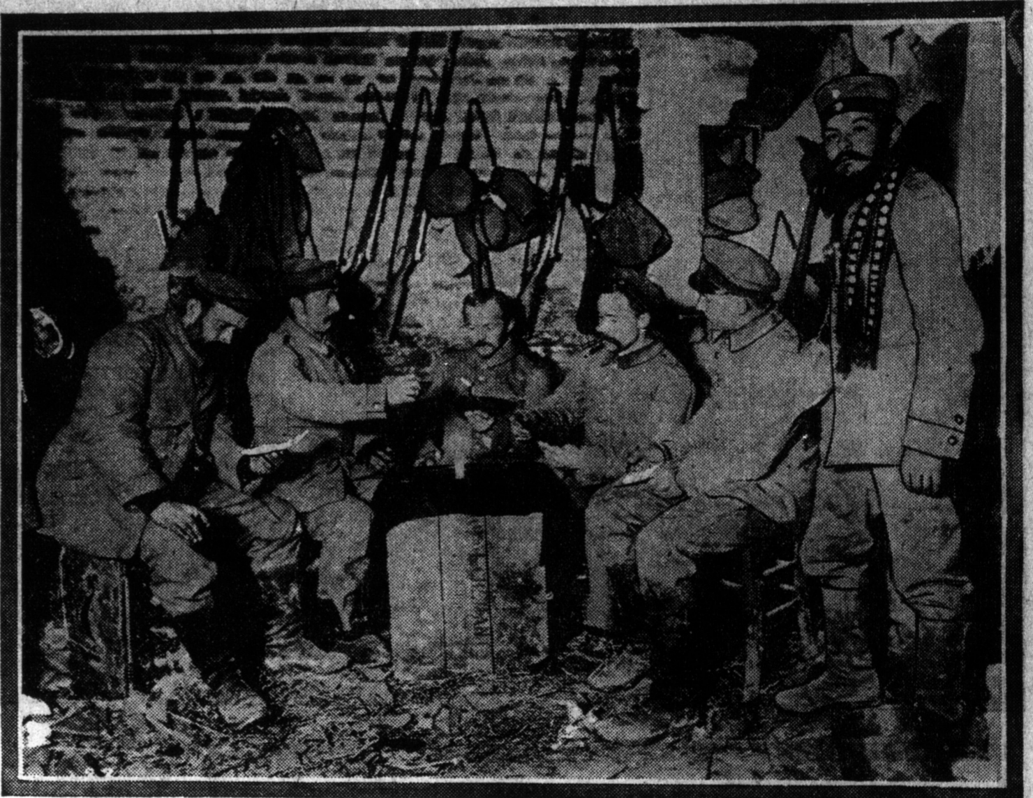
Russian soldiers are the greatest card players in the world—It is their amusement in the trenches and in billets—The Russian soldier is said to be stolid and a ponderous thinker, but some of his games are very intricate.