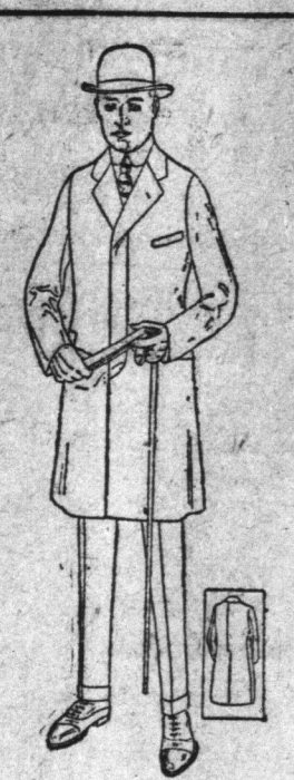
No. 526 The Silk-Faced Chesterfield