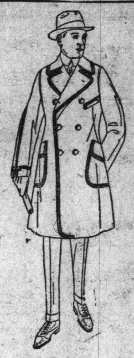
No. 523 Smart New Style Ulsterette