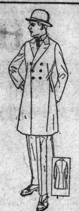
No. 525 Form-Fitting Top Coat