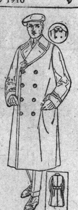
No. 531 The True Canada Ulster