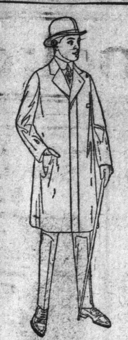
No. 524 The Neat Fly Front Chesterfield