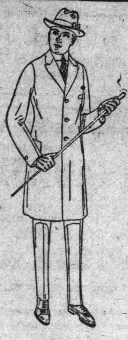
No. 522 Button-Through Chesterfield

3. Edwin Parr, 106 (Robinson), $6.10, $3.50, $2.50.