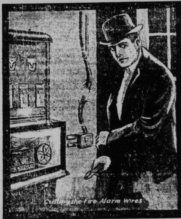
SCENE FROM "THE STILL ALARM" AT THE HAPPY HOUR WED.

LYDIA E. PINKHAM MEDICINE CO. LYNN, MASS.