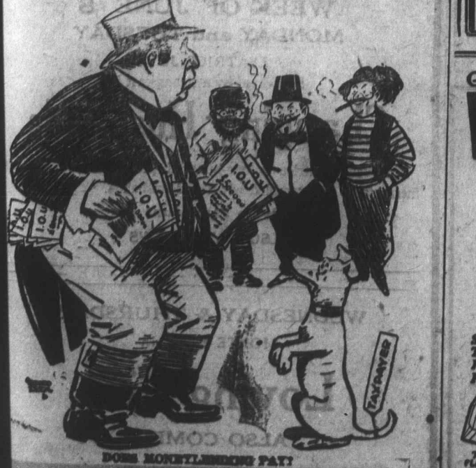
DOMS MONEY-LAUNDRING PAT?

Insist on getting the RED and WHITE package which contains crisp, flaky Cream Sodas fresh from our ovens to you Your Grocer has them J. A. MARVEN, LIMITED MONCTON - ST. JOHN - HALIFAX - MONTREAL