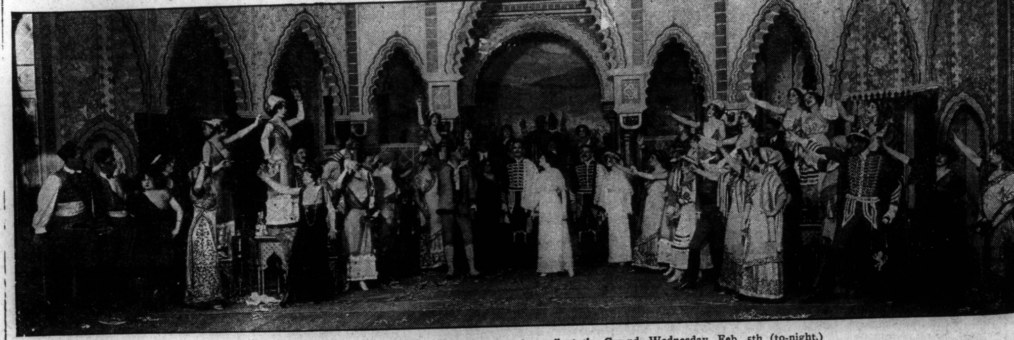
Scene in Act II, the Musical Success, "The Balkan Princess," at the Grand, Wednesday, Feb. 5th (to-night)