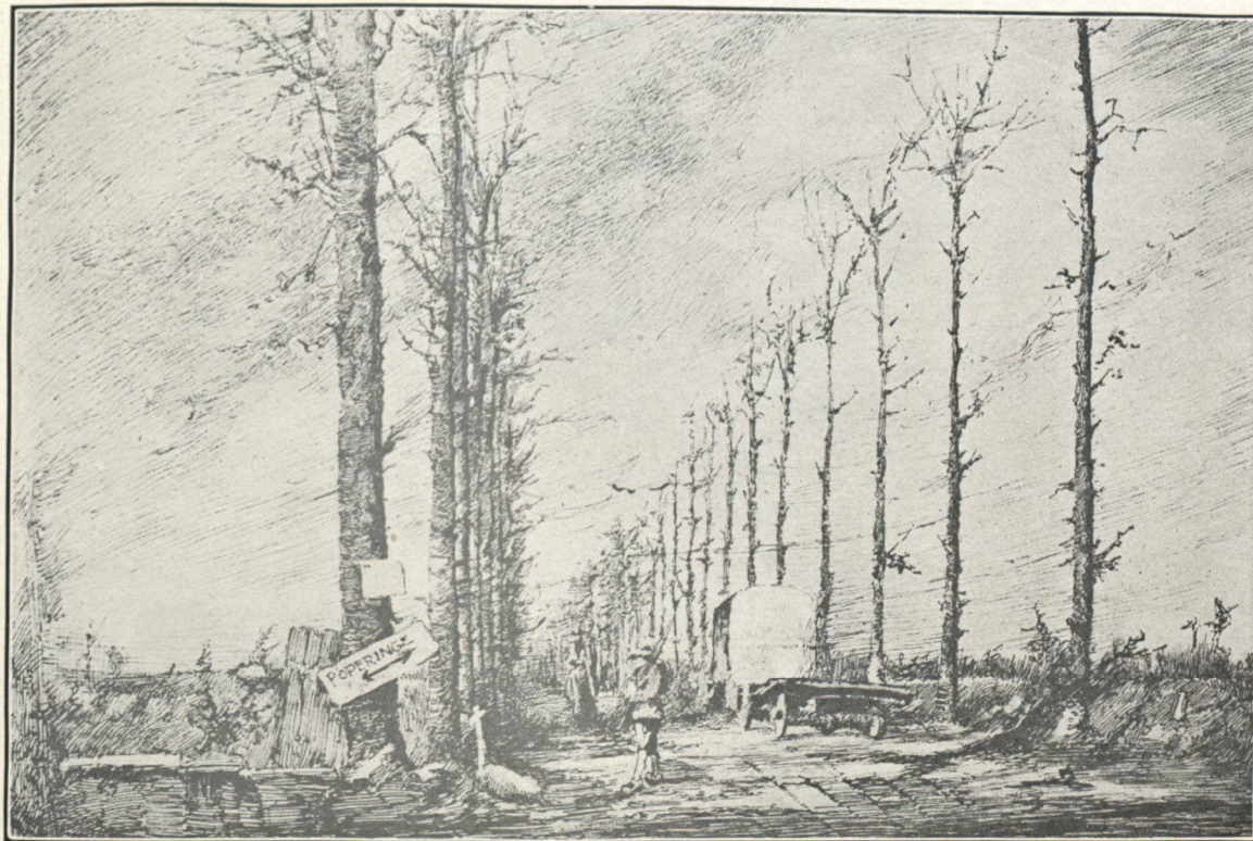
"THE ROAD TO POPERINGHE."