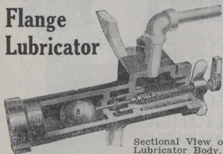
Sectional View of Lubricator Body.