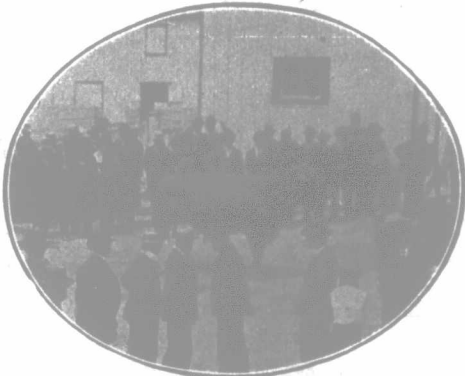
Farmers' Boys Learning to Judge Beef Cattle at the O. A. C.