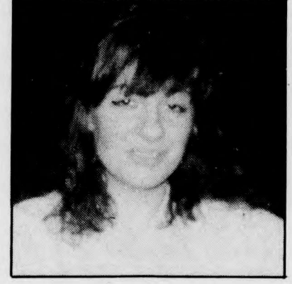
"Yes. I would because it's great that Excalibur takes time to ask people's opinion."