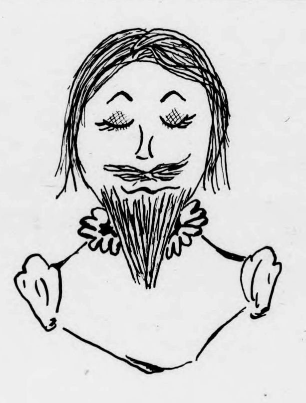
Would the Bard have comment on all these film reviews? See elsewhere on page.