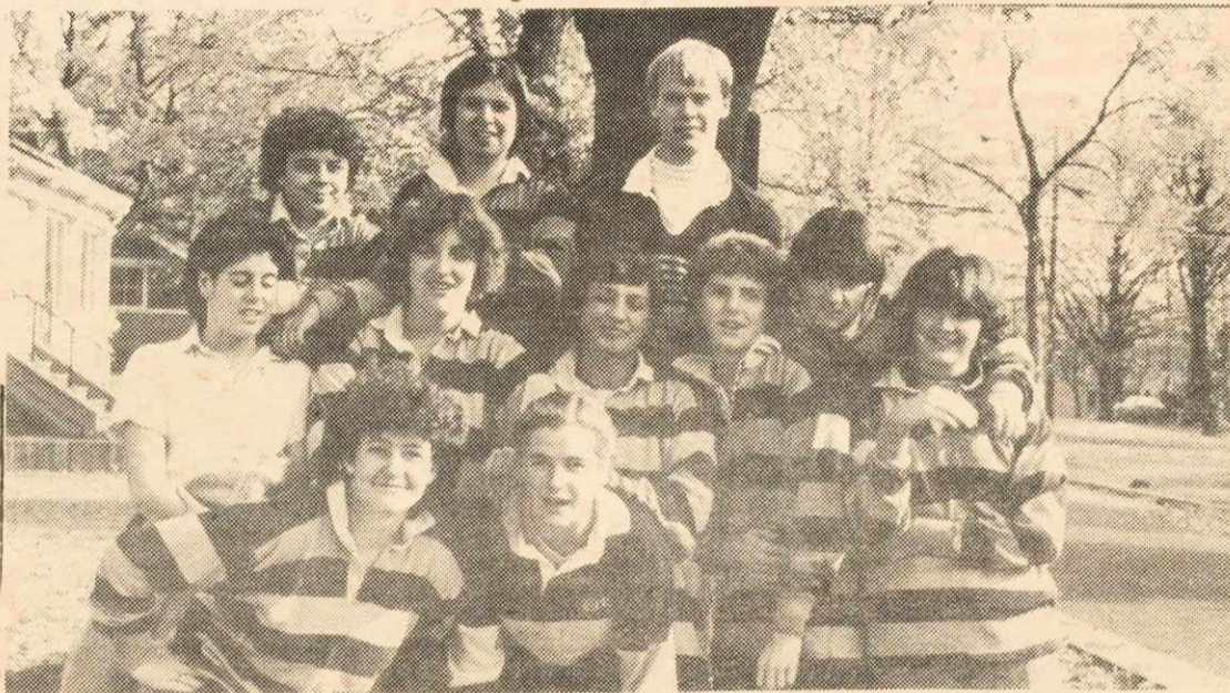
The Dahousie women's rugby team looks pensive as they contemplate the season ahead