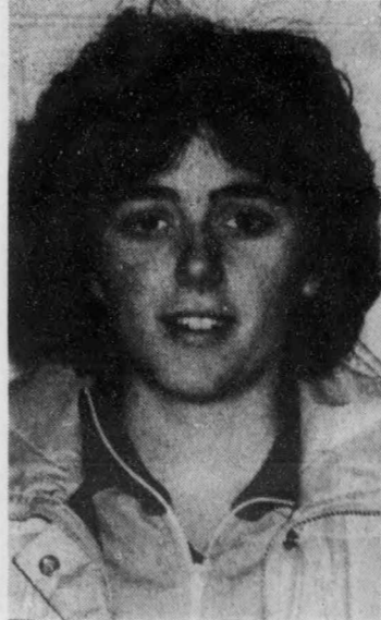
FEMALE ATHLETE OF THE WEEK