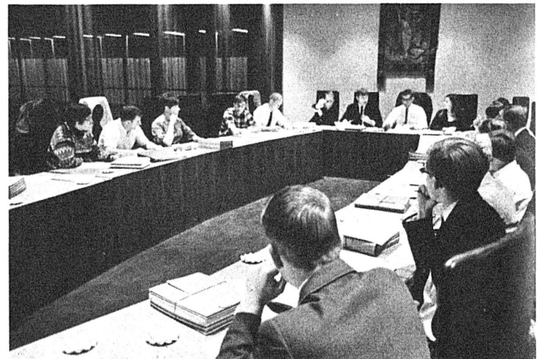
THIS IS YOUR INDUSTRIOUS COUNCIL

The NDY realized the hopelessness of even considering working within such an existing body and sees their only alternative is to build a strong syndicalist movement which will eventually necessitate a change in the existing social order. Quebec is leading the way in this struggle under the Union General des Etudiants du Quebec. In time such a student worker movement will co-manage