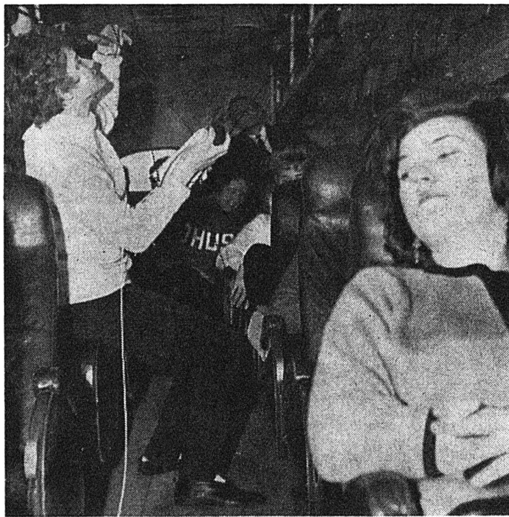
BUSILY RE-KNITTING a sweater demolished on Saskatoon trip, U of A co-ed finds that too many eager helpers can be a hindrance.