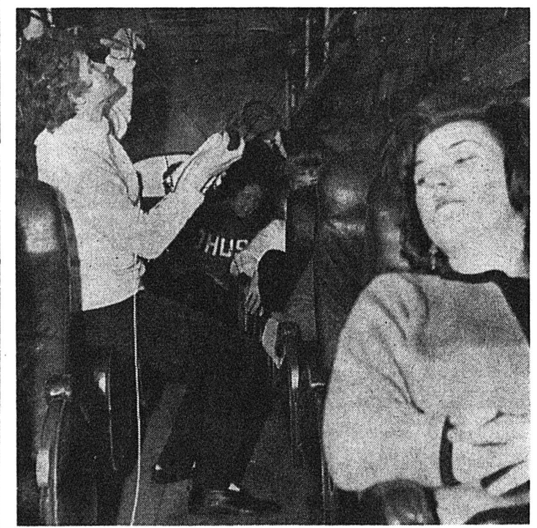
BUSILY RE-KNITTING a sweater demolished on Saskatoon trip, U of A co-ed finds that too many eager helpers can be a

REDUCED FARES-Students wishing with no admission charge. Everyone is welcome. Even YCF'ers. POLITICAL SCIENCE CLUB will hold a meeting on Thursday, Dec. 13 in West Lounge, 4:30 p.m. Model Parliament will