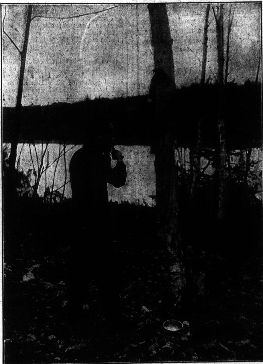
Experiences of the Wilds.

Sir,—The other day a friend lent me the Nov. number of your magazine, and I became quite interested in reading the many letters sent you, so I thought that here might be a good medium through