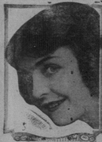
Enid Bennett in "The Law of Men"

Calgary: 210 Lancaster Bldg. Phone 4651 Edmonton: 10220 101st Street. Phone 2451