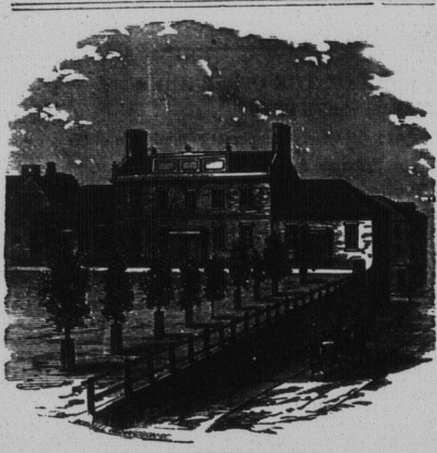
OLD DALHOUSIE COLLEGE.

With regard to the failure of Dalhousie College in answering the expectations formed on the opening by the Earl of Dalhousie, I am unable to assign a cause, unless it be due to the old school of politicians, who did not only neglect to send their sons to it, but threw in its way all the discouragements within their reach at the time, to render it unprofitable. I can account for the failure in no other way. Its large class rooms stood idle for years. No body but the Janitor occupied the premises, except that part in the basement which was let for stores. During the summer of the cholera (in 1834) the building was used as an Hospital, whither the sick and dying were carried daily in large numbers to be treated, and from whence many a dead body was conveyed