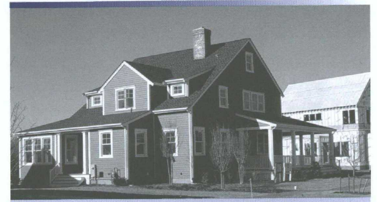
A DAC International home in Easton, Maryland.