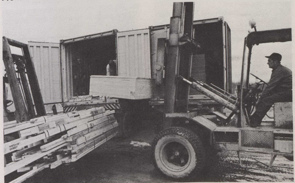
Bolduco Incorporated workers load containers with material for shipment to Uruguay.

A Quebec housing company is making its mark abroad exporting prefabricated dwellings to a number of countries.