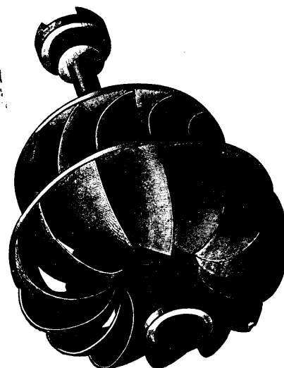
Cut Showing Wheel Removed from Case.

84 per cent. of power guaranteed in five pieces. Includes whole of case, either register or cylinder gate. Water put on full gate or shut completely off with half turn of hand wheel, and as easily governed as any engine.