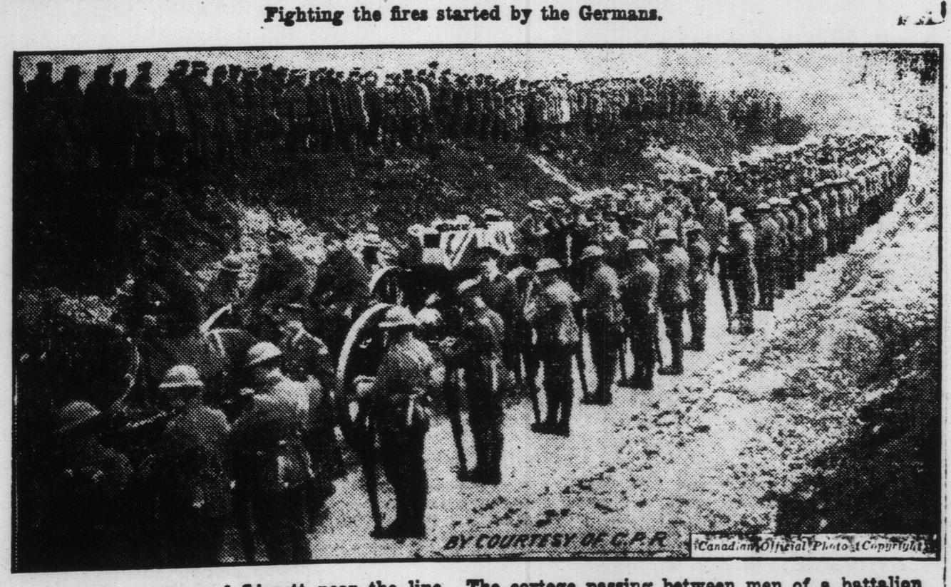
Funeral of General Lipsett near the line. The cortege passing between men of a battalion which the general brought to France, H.R.H. the Prince of Wales followed the coffin,