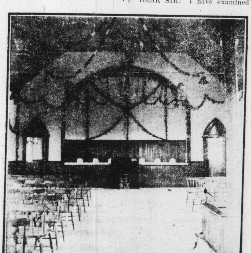
THE INTERIOR OF RECREATION HALL Where the entertainment was held Thursday evening.